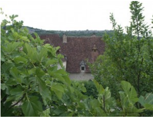
Maison depuis le pré