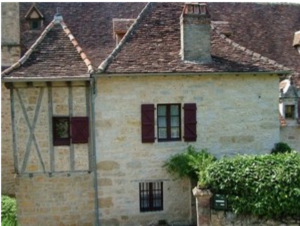
Maison depuis le pré