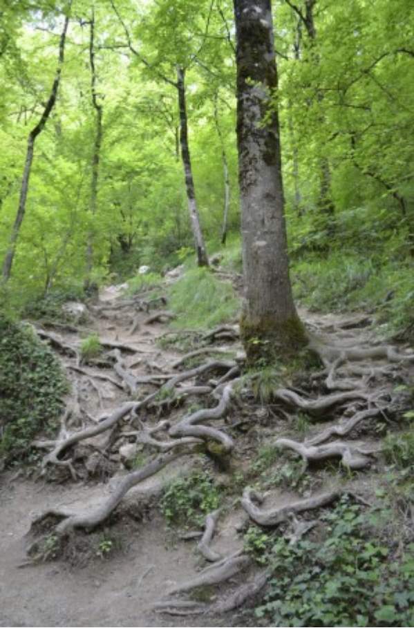
Chemin de la cascade