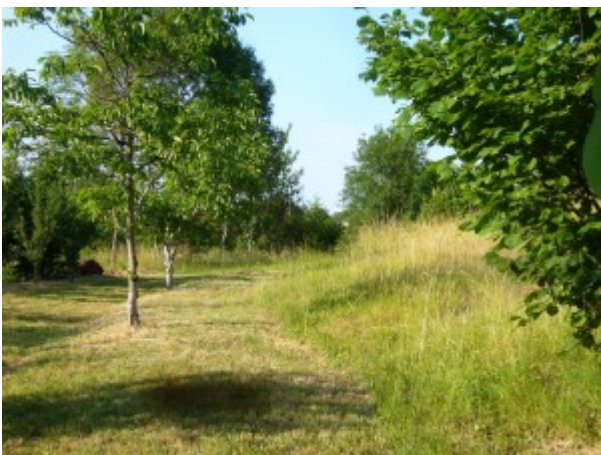
Notre pré privé (Le Ranquet)