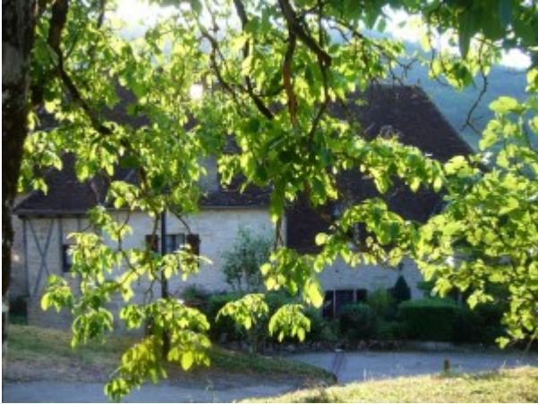
Maison depuis le pré