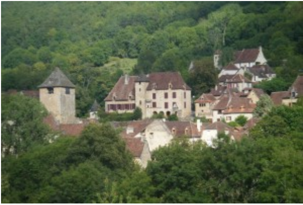
Autoire-Château de Busqueilles