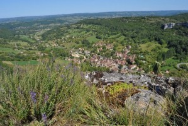
Village vu du causse