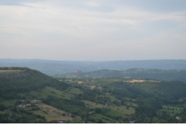
Vue du causse-Château de Castelnau